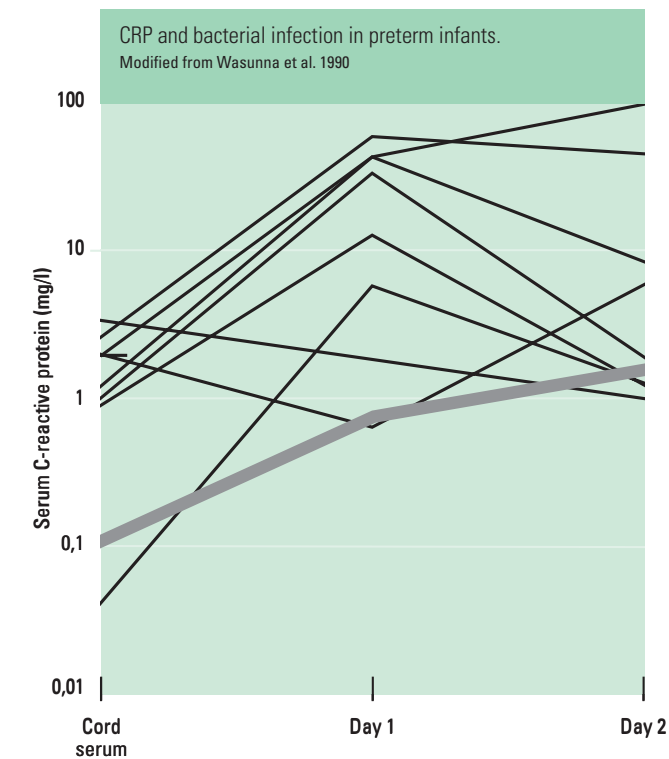
Serum CRP concentration in individual preterm neonates with confirmed bacterial infection. 104 preterm infants without clinical or laboratory evidence of infection (shaded line). 9 cases with confirmed infection (black line).

The results of the actim™ CRP Sensitive test are easy to read. The more CRP the sample contains the more blue lines become visible: a reading with no blue line means a CRP of under 0.2 mg/l, one line means 0.2 to 1 mg/l, two lines 1 to 5 mg/l, and three lines a CRP of over 5 mg/l. A red control line in the result area of the dipstick indicates the test was correctly performed. Accurate results are ready in just five minutes.