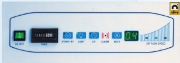
Microprocessor Control Panel