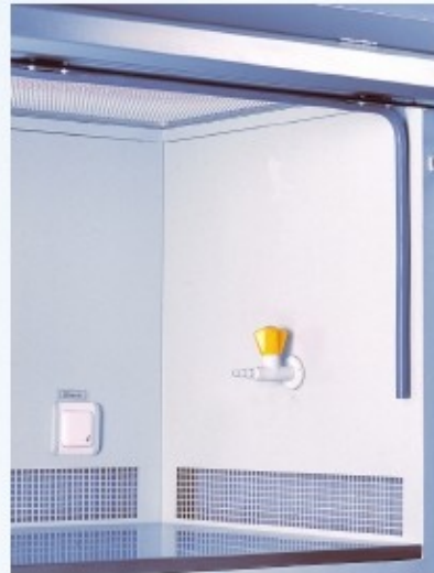
View from the inside of cabinet